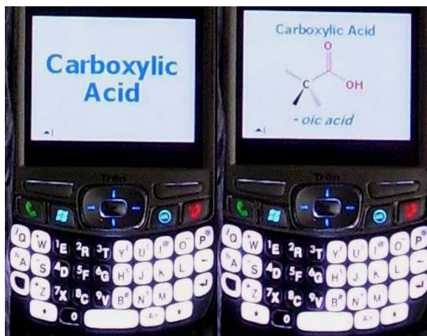
Figure 2. Example of "front" (left) and "back" (right) of a functional group flash card.