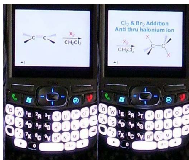
Figure 4. Example of "front" (left) and "back" (right) of a reaction flash card.