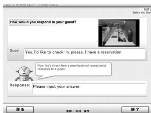
Figure 2: Screenshot of “Before You Start”

This activity is intended to check how much students know about hospitality English language skills. Students input their own responses to a guest’s questions and check what a professional receptionist in the video clip says in order to recognize differences between their assumptions and professional hospitality English standards. Fig. 2 shows the screenshot of “Before You Start.”