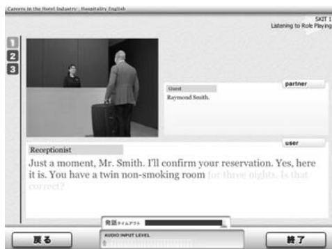
Figure 6: Screenshot of words recognized by the speech recognition system

Students are required to say aloud the model phrases as they watch the video clip of each text and to pronounce the phrases correctly. The English speech recognition system assesses students' utterances and a learner's pronunciation problems can be immediately detected by an acoustic database of Japanese learners' English pronunciation. The pronunciation errors in the students' utterances are counted and at the same time the words which were recognized by the speech recognition system are shown in green on a screen display as indicated in Fig. 6.