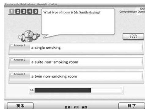
Figure 3: Screenshot of comprehension questions

This language activity is intended to check whether students understand the content of each skit. After watching a video clip of each skit, students are required to answer five questions regarding the contents of the skit. Students are requested to listen to the questions without reading the text. However, students who have low listening ability may read the question by pushing the button “Hints” as Fig. 3 shows. After answering all the five questions, they check their answers with a screen display which indicates failure or success with the figures × and ○.