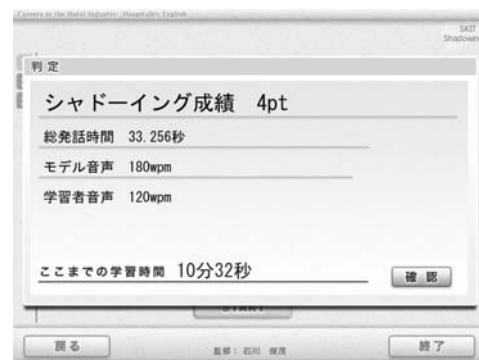
Figure 7: Screenshot of screen display of the Words Per Minute rates

Watching a video clip of each skit and listening to utterances from the video clip, students are required to repeat what they hear. They are also required to imitate the tempo of the utterances. After the English speech recognition system assesses the students’ utterances based on the perspective described in Section 5.3 and shows the Words Per Minute rates of both the model sounds and the students’ speech as shown in Fig 7, a screen display of the script is shown in order to indicate whether the students’ pronunciation is correct or not. The words which students pronounce correctly are colored black, while the words which students pronounce incorrectly are colored red as is shown in Fig. 8. Students are able to listen to their own utterances as well as to the model utterances in order for students to compare the differences of the tempo.