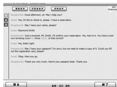
Figure 8: Screenshot of the results of students’ shadowing