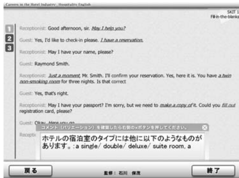
Figure 5: Screenshot of a pop up window in fill-in-the-blank questions

Students are required to spell out the vocabulary that they had learned in the vocabulary learning preparation task to check whether they have memorized the spelling of the words. Students fill in blanks typing out the last sound that they hear and by checking pop up windows attached to the underlined and italicized parts in the script, students also learn useful expressions which are related to the underlined and italicized parts as shown in Fig. 5.