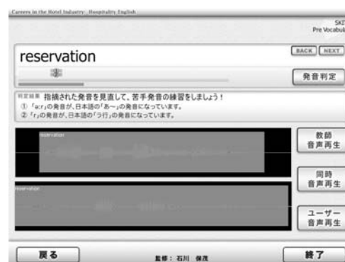
Figure 4: Screenshot of vocabulary learning preparation

Students learn useful vocabulary in each skit. After listening to model pronunciation examples of vocabulary, they say the words aloud. An English speech recognition system developed by Advanced Media, Inc. features a continuous speech recognition system which can evaluate Japanese learners’ English pronunciation. With an acoustic database of Japanese learners’ English pronunciation, a learner’s pronunciation problems can be immediately detected and appropriate feedback on pronunciation errors and an estimate of intelligibility can be provided as Fig. 4 shows.