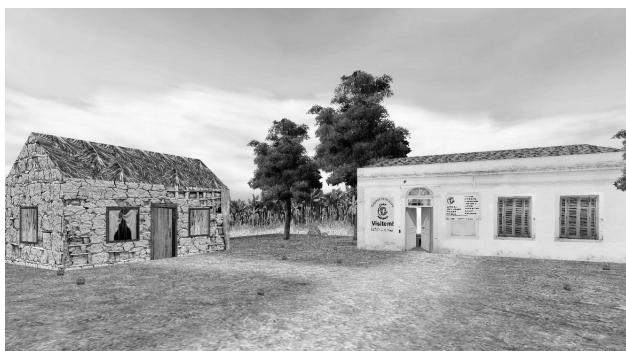
FIGURE 1: Main scenario of the Chagas disease media. "Entering" the house, the user will have access to information about the disease, through animations, videos and audios. The building on the right illustrates the education and dissemination sector of our research center, and there "entering" the user will have access to information about the methods and equipment used in research on the treatment and diagnosis (all images are originally displayed in color).

Audio and writing are available in Brazilian Portuguese: translations for other languages are welcome.