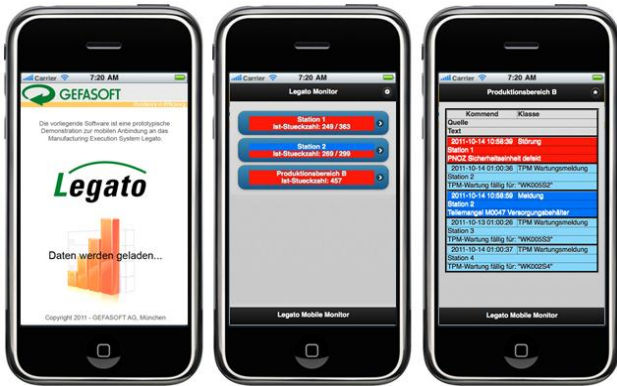
Figure 4: PhoneGap interface with iLegato Monitor-App

apps) nor purely web based (many of the functions would be supported by HTML5). One disadvantage is that hybrid applications do not always have full access to the device application programming interface (API), it depends from the used OS.