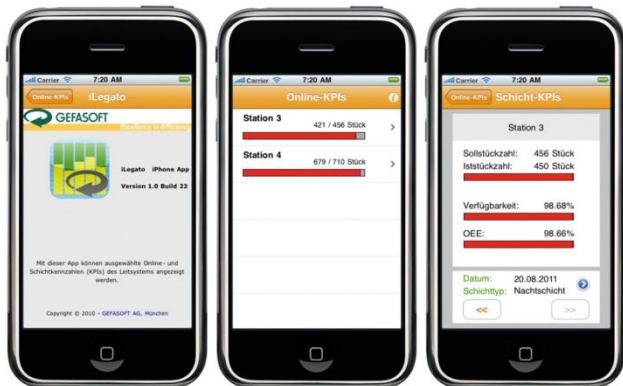
Figure 3: Native iPhone interface with iLegato KPI-App

Using for example the iLegato KPI-App (s. Fig. 3) the employee has the possibility to access the subscribed key data of his production sector any time. Based on the OEE, it is possible to use additional key data of the node for assessment. Alerts und process values can easily be observed and if necessary actions initiated. The configuration is made comfortably in an easy way via the regular web client of the control system, executable on a standard web browser.