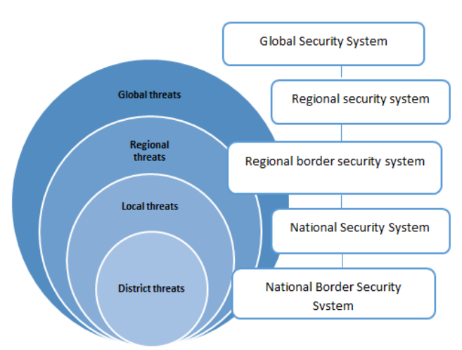
Figure 1. Threats and security systems

Border security is tied with a full threat system to native, local, regional and global security. A security system is created corresponding to each level of the threat, which must establish a connection with other level systems. For example, expert of security of Hungary, Istvan Samu [10] displays threat levels and according security systems visually as follows (Figure 1).