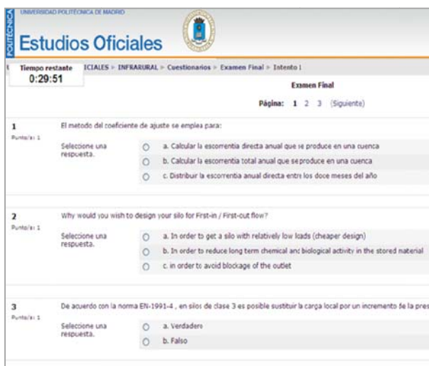
Figure 1. Evaluation test developed with Moodle 1.9

virtual tests, (iii) the system must be able to randomize the questions and answers to be included in the test, and (iv) instructors can override the automated scoring and determine how to communicate test results to students.