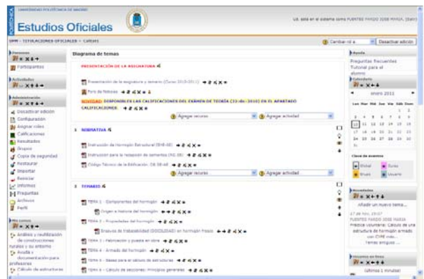
Figure 3. Structure of an e-learning course in Moodle 1.9.

Although most of the e-learning platforms enable teachers to form groups for collaborative learning activities, there are particular differences in their groupwork functionalities. Although nearly all the VLEs enable teachers to email a group specific notices and information, not all of them allow instructors to deliver specific assignments or assessment tests for a particular group not accessible to the rest of the class. The Sakai 2.5 e-learning platform, for example, assigns each group a private folder that enables members to upload and download homework assignments and specific documentation. Some other e-learning software such as Moodle 1.9 or Dokeos 1.8 lacks this feature.