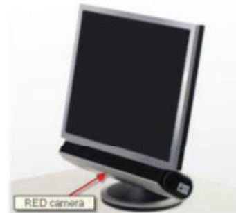
Figure 1: Static eye tracker (SMI)

Eye tracker was originally designed as a device that from a point (monitor, etc.) - recorded the sight of human. However, if the person changed the direction of view outside the sensing field views, the connection is interrupted. These types of eye trackers can be called static (Figure 1). With a new technology come also new types of eye trackers that allow collection of data freely moving people. It is a dynamic eye tracker: camera built-in glasses.