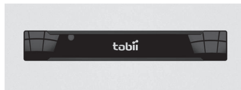
Figure 2: Tobii PC Eye Go – eye camera on size of chocolate bar

This eliminates the need testers to focus on the computer screen, or wear other recording equipment. The research team is able to observe a wider range of situations. Glasses give scientists the ability to capture and objective insights into human behavior in any real environment. They show exactly what the man looks on in real time during the run free as for example in a store or restaurant in the real world. Glasses also recorded a view to the sides, using the static species was not possible, thus guaranteeing natural behavior and increased the objectivity and validity of measurement data. The latest products include small eye-camera on the size of a chocolate bar, which can be connected to any device via the USB port. The device can be operated only by gaze. Eye camera focuses view taken by two infrared lamps, which in turn enable the management of eye movement (Figure 2).