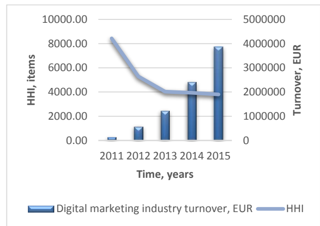
Figure 2. Changes in the Herfindahl-Hirschman Index in the turnover of the digital marketing industry in Latvia in 2011-2014 [prepared by authors]

Changes in the Herfindahl-Hirschman Index in correlation with the changes in the industry turnover are shown in the graph.